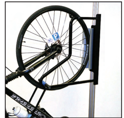
U-Lock compatible to secure bike and frame