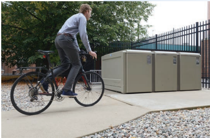
Convenient lockers park 6 bikes and blends in with surrounding environment

With bike racks purchased through their community investment fund, our partner is hoping to encourage cycling throughout their city as a means of promoting a community-wide healthy living