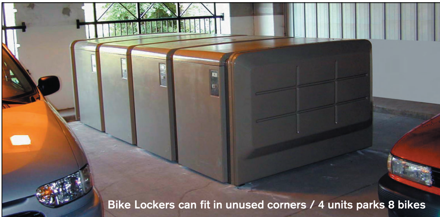
Bike Lockers can fit in unused corners / 4 units parks 8 bikes