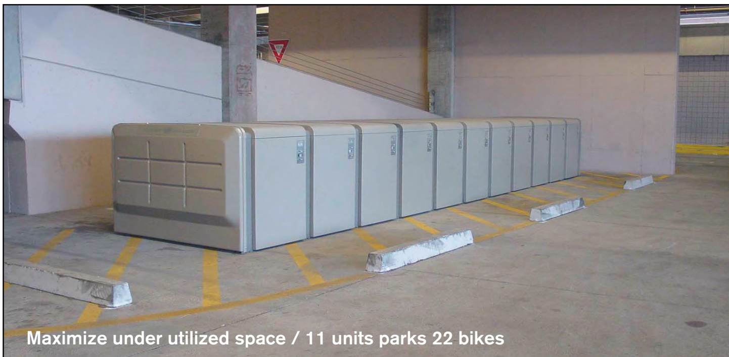
Maximize under utilized space / 11 units parks 22 bikes