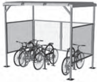
COVERED BIKE PARKING